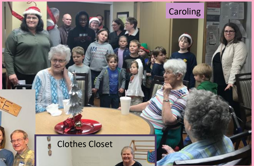
Day of Service